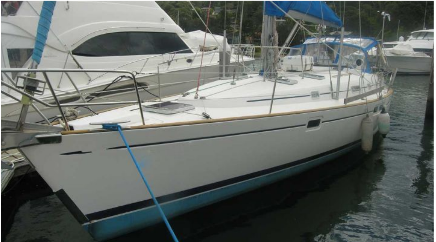
Beneteau Oceanis 461