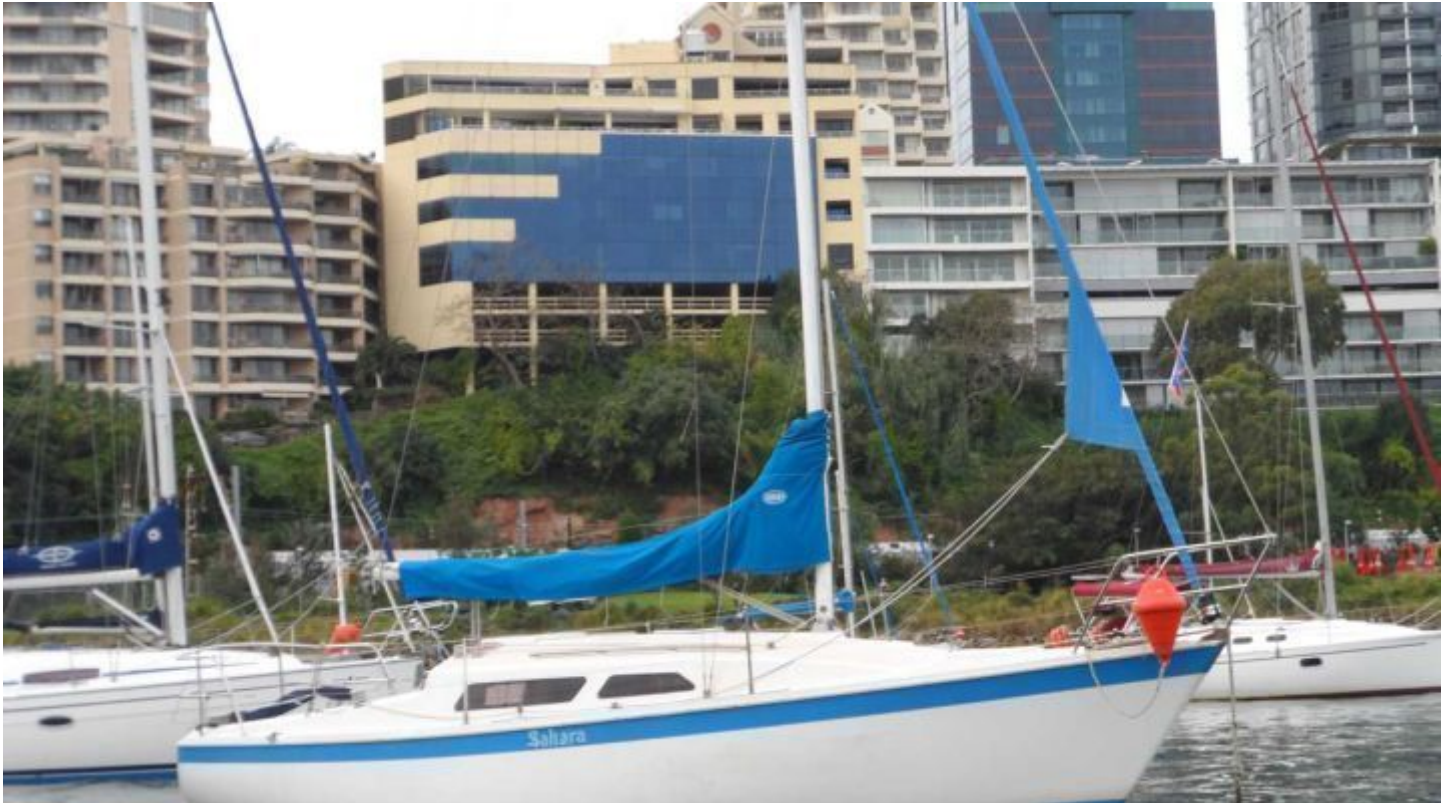
Northshore 27 - SOLD