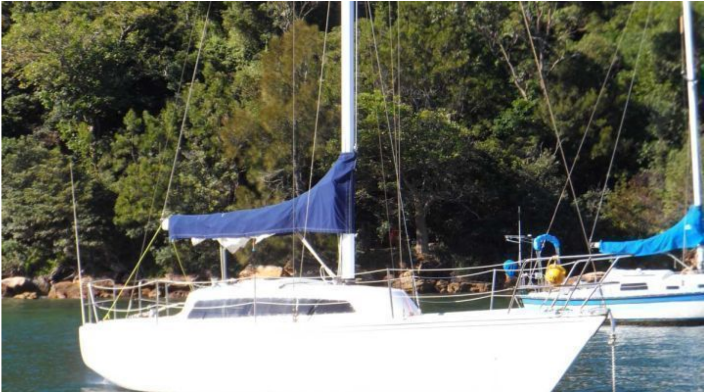
Peterson 30 - SOLD